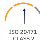
ISO 20471 CLASS 2