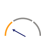
ISO 20471 CLASS 1